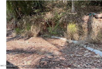
MIS Volunteering in Costa Rica