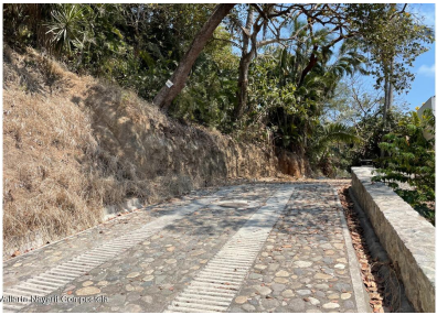
MIS Volunteering in Costa Rica