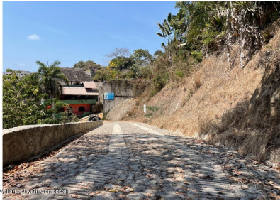
MIS Volunteering in Costa Rica