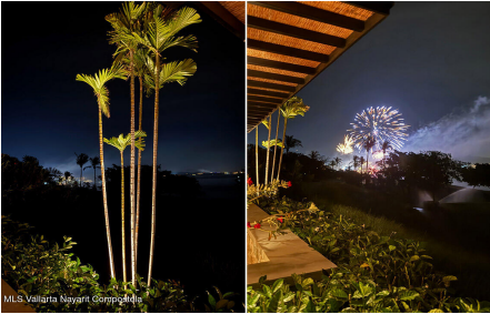
MLS Valarta Nayanti Compostela