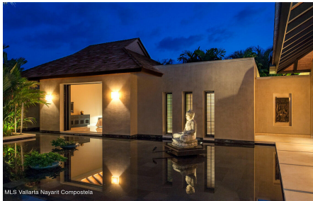
MLS Valarta Nayanti Compostela