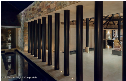
MLS Valarta Nayanti Compostela