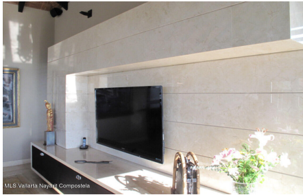
MLS Valarta Nayanti Compostela