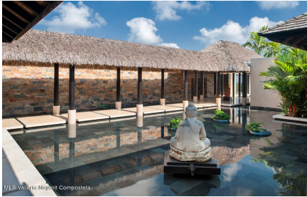
MLS Valarta Nayanti Compostela