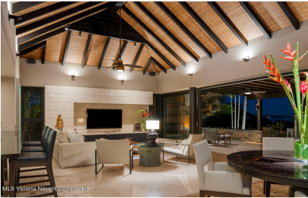
MLS Valarta Nayanti Compostela