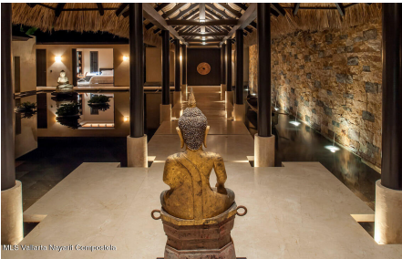
MLS Valarta Nayanti Compostela