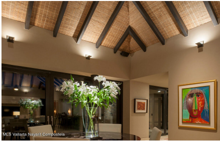
MLS Valarta Nayanti Compostela