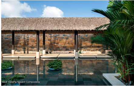
MLS Valarta Nayanti Compostela