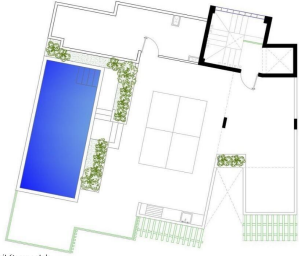
MİS Vallarta Niyeti Kompleksi