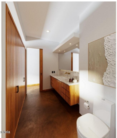
MİS Vallarta Niyeti Kompleksi