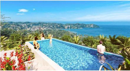
MİS Vallarta Niyeti Kompleksi