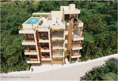
MİS Vallarta Niyeti Kompleksi