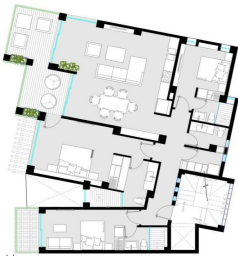
MİS Vallarta Niyeti Kompleksi