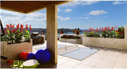
MİS Vallarta Niyeti Kompleksi