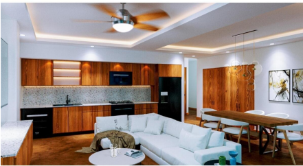
MİS Vallarta Niyeti Kompleksi