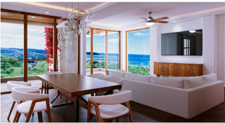
MİS Vallarta Niyeti Kompleksi