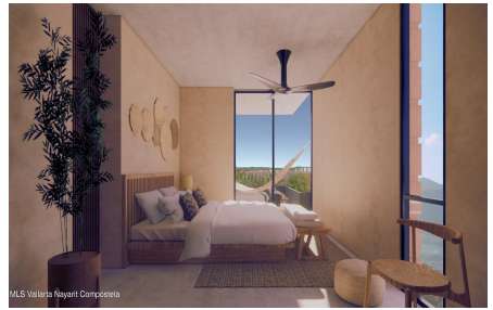
MLS Valeria Nigetti Composita