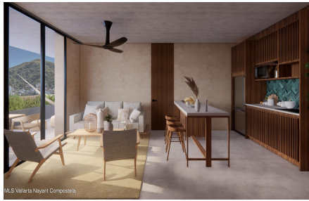
MLS Valeria Nigetti Composita