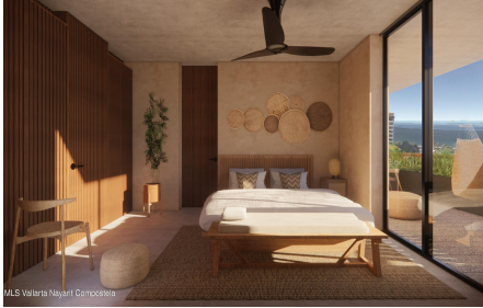
MLS Valeria Nigetti Composita