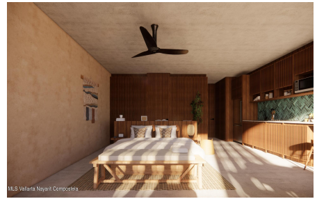
MLS Valarta Niyati Composites