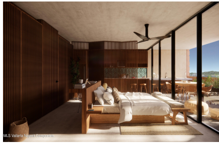
MLS Valarta Niyati Composites