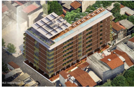
MLS Valeria Nayeri Compostela