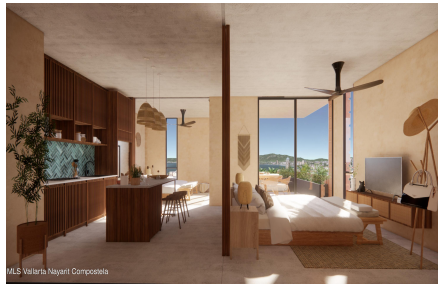
MLS Valeria Nayeri Compostela