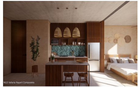
MLS Valeria Nayeri Compostela