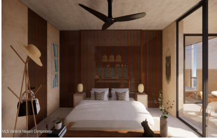
MLS Valeria Nayeri Compostela