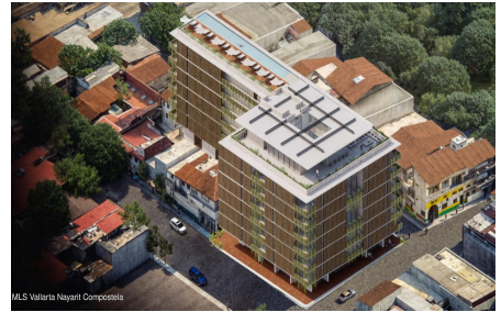
MLS Valeria Nayeri Compostela