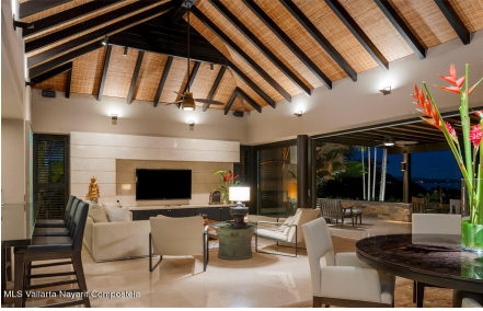
MLS Valarta Nayanti Compostela