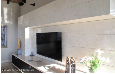
MLS Valarta Nayanti Compostela