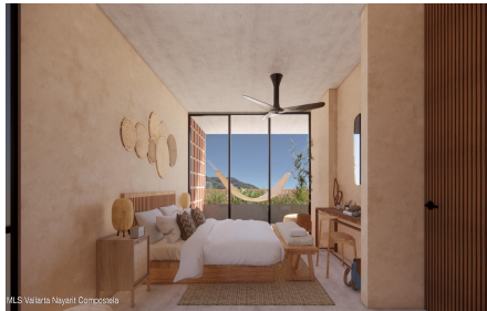
M/S Valeria Nuyari Compostela