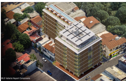
M/S Valeria Nuyari Compostela