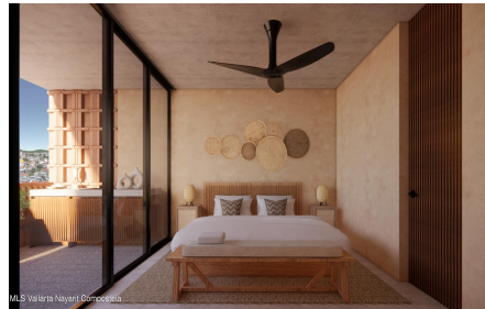
M/S Valeria Nuyari Compostela