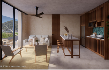
MLS Valarta Niyati Composites