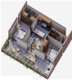
MLS Valarta Niyati Composites