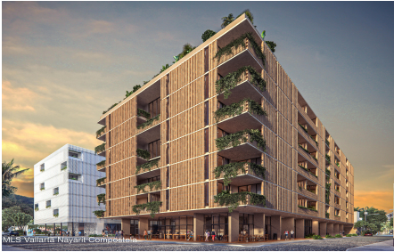
MLS Valarta Niyati Composites